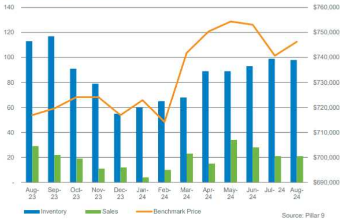
INVENTORY, SALES, AND PRICE