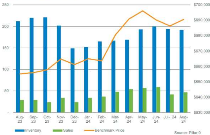
INVENTORY, SALES, AND PRICE

For detailed statistics in your area: https://www.creb.com/Housing_Statistics/